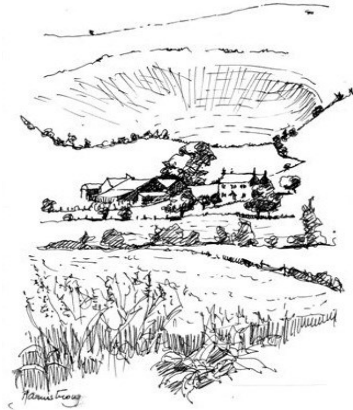
Whitecliff Farm Brixton Deverill