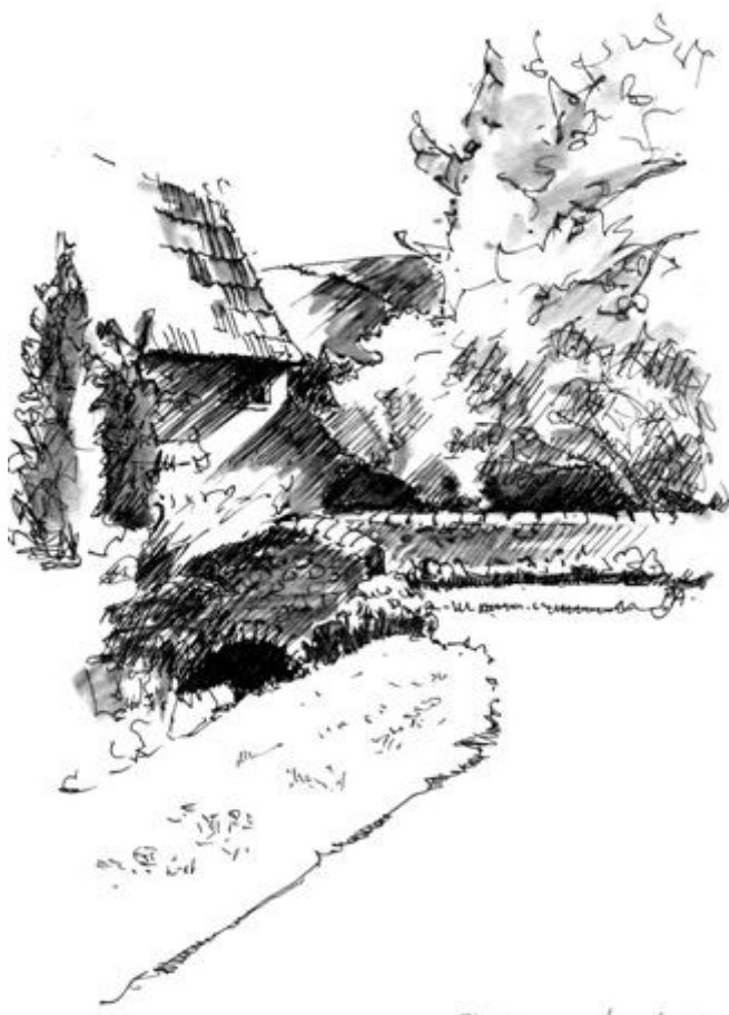
The Marsh, Longbridge Deverill