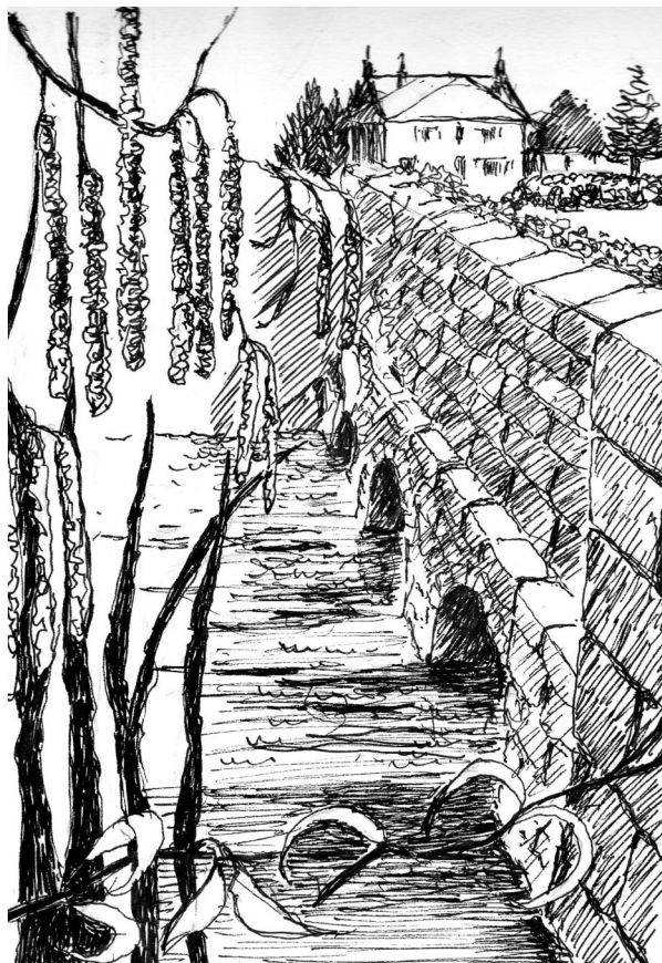
The bridge, Sand Street, Longbridge Deverill by Pat Armstrong