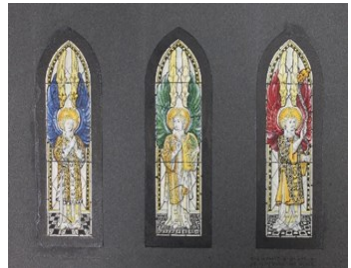
Image: Proposed stained glass window designs for St. Peter and St. Paul's, c.1925

We have also acquired a range of additional collections relating to the area. These include records of the local Women's Institute group and parish councils plus records relating to the cinema at Sandhill Camp during World War 1. We are also the repository for county and local councils, whose files contain a wealth of information on local people, buildings and events.