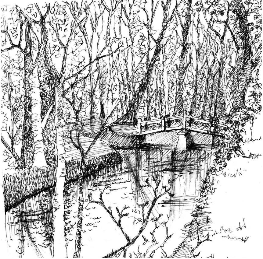
The Ford, Kingston Deverill