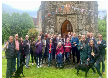
Jubilee celebrations - Brixton church

Grateful Thanks: These magical, memorable community moments could not happen without hard work and dedication of local residents. Huge thanks go to everyone involved in the planning of this perfect Jubilee Celebration, and to all who mucked in on the day to make the events so successful. Special thanks to the Village Hall Committee who worked for months to organise this celebration, from the early days of gaining funding from the Parish Council to the logistics of the final days. Absolute Stars!