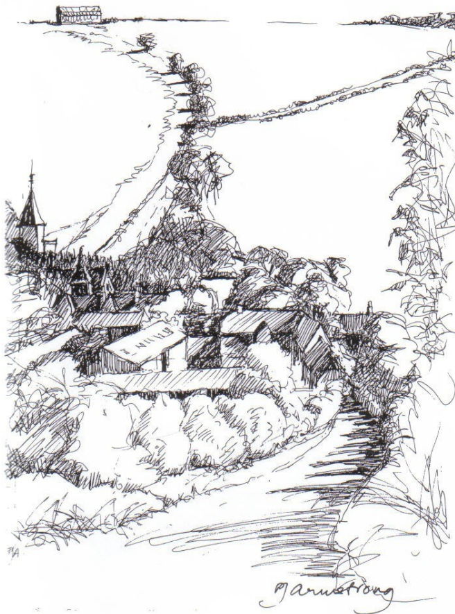
King's Hill from the north Kingston Deverill