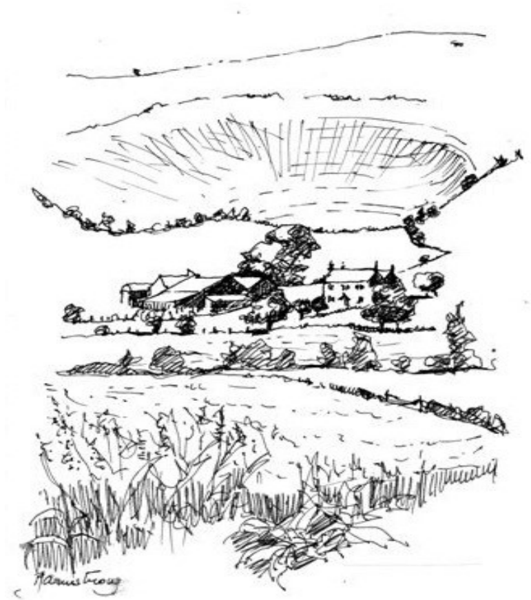
Whitecliff Farm Brixton Deverill