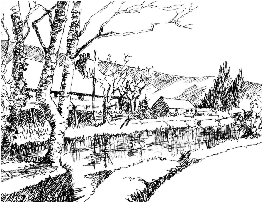
The river at Kingston Deverill by Pat Armstrong