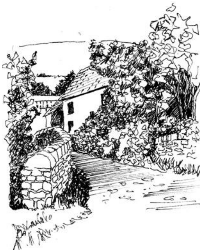
Pope's House, Kingston Deverill