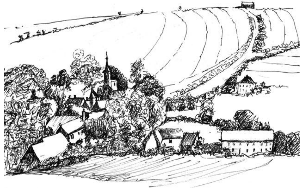
Kingston Deverill from north west