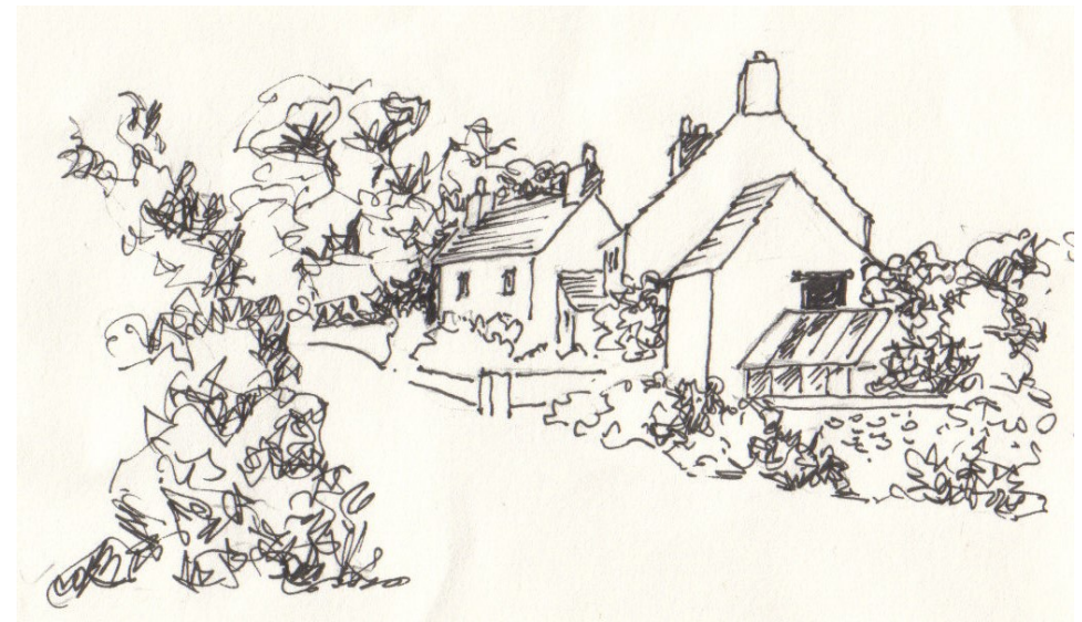
Monkton Deverill