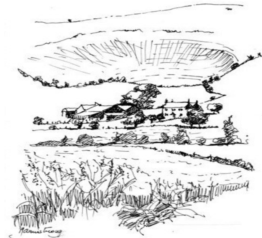
Whitecliffe Farm, Brixton Deverill