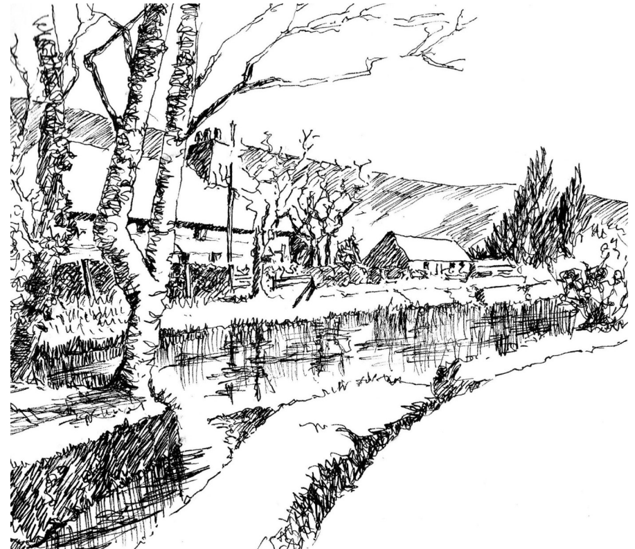
The river at Kingston Deverill by Pat Armstrong