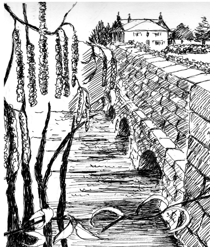
The Bridge, Sand Street, Longbridge Deverill by Pat Armstrong