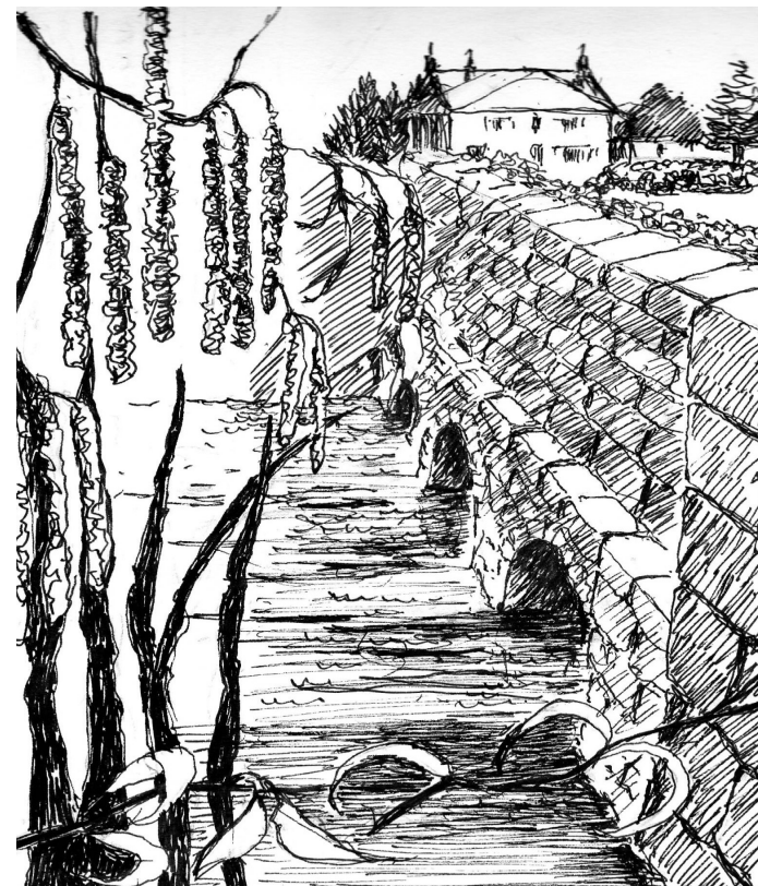
The bridge, Sand Street, Longbridge Deverill