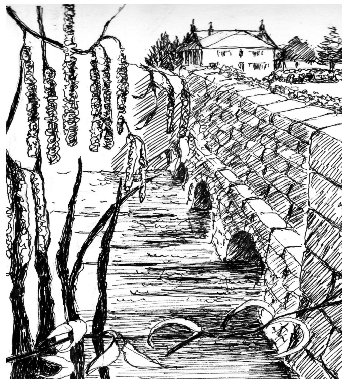
The Bridge, Sand Street, Longbridge Deverill