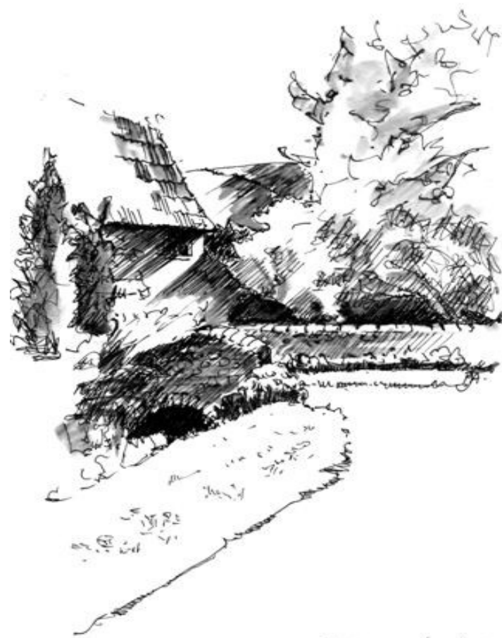
The Marsh, Longbridge Deverill