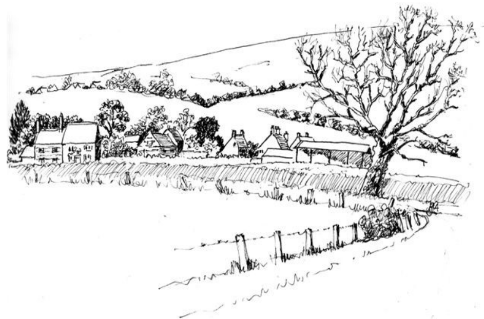
Monkton Deverill